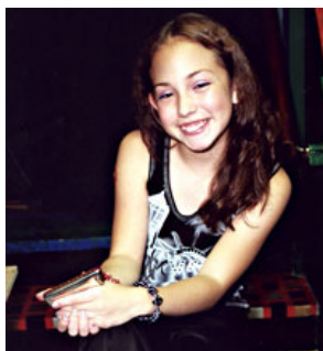
Sunny Girl: How blue can she get?